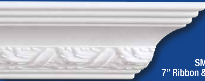
SM7-RL 7" Ribbon & Leaf

WITH OVER 70 PATTERNS TO CHOOSE FROM, ELITE MOULDINGS IS AN ARCHITECTURAL MOLDING INDUSTRY LEADER.