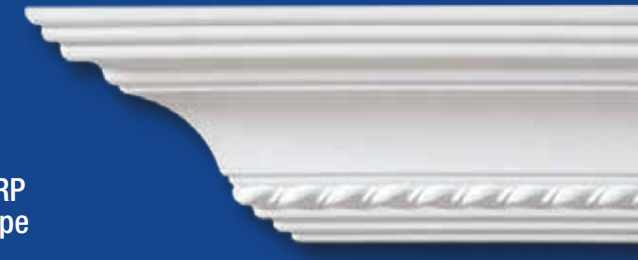
SM7-RP 7" Rope