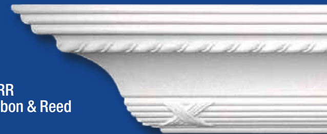
SM7-RR 7" Ribbon & Reed