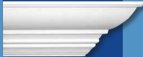
Modern Profile Available in 5, 7 and 9" versions