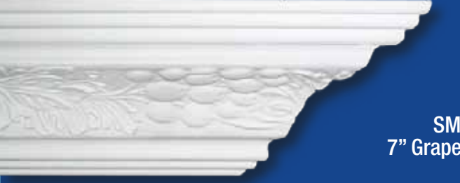
SM7-GV 7" Grape Vine