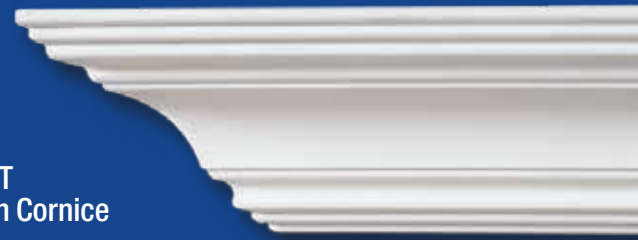
SM7-ST Smooth Cornice