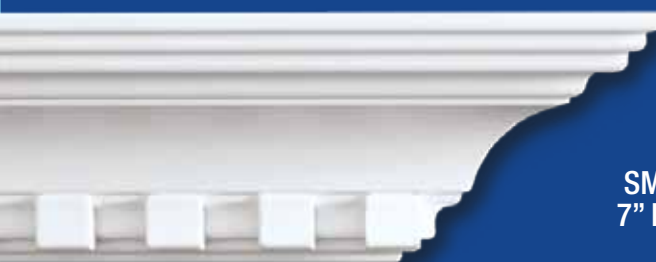
SM7-DL 7" Dentil