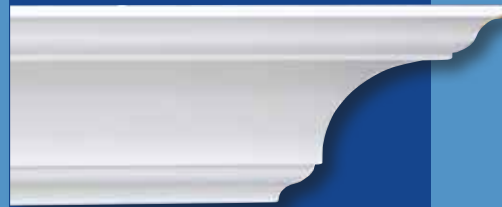
Deep Cove Profile Available in 5 and 7" versions

EliteTrim™ cornice moldings offer the rich, carved detailing of expensive architectural wood and plaster moldings at an affordable price. The intricacy of the detailed patterns embossed on the face is what distinguishes EliteTrim™ cornice moldings from the products offered at big box stores and other retailers. The 5" is recommended for 8 foot ceilings, our 7" for 9-10 foot and 9" for ceiling heights of 10 to 12 feet.