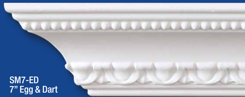
SM7-ED 7" Egg & Dart

All styles are also available in 5" and 9" sizes.