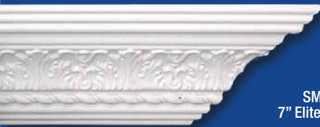
SM7-EL 7" Elite Leaf