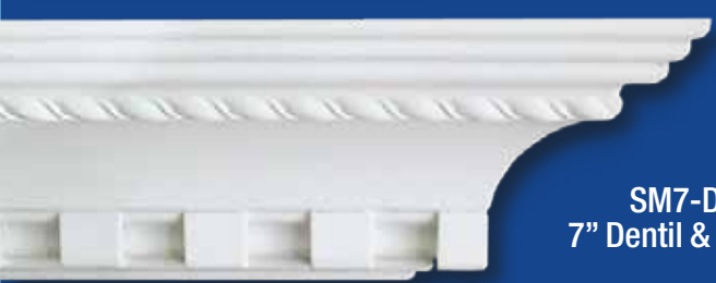
SM7-DL-RP 7" Dentil & Rope