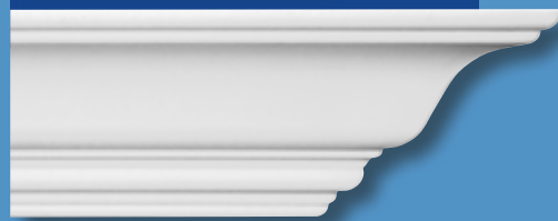
Tuscan Profile Available in 5, 7 and 9" versions