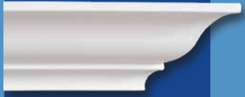
Georgian Profile Available in 3, 4 and 5" versions