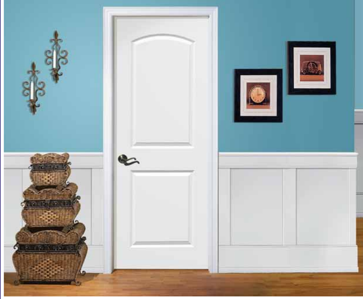
Flat panel wainscoting kit

Why is panelled wainscot the oldest and most respected of all wall options? It's just plain gorgeous. Who can resist the eye-catching shadow lines created as light washes across the profile of delicately beveled panels? And with our Elite Panel kits, you get all this plus the chance to customize panel width perfectly for your room. If you've got your heart set on authentic panelled wainscoting, why settle for anything less?